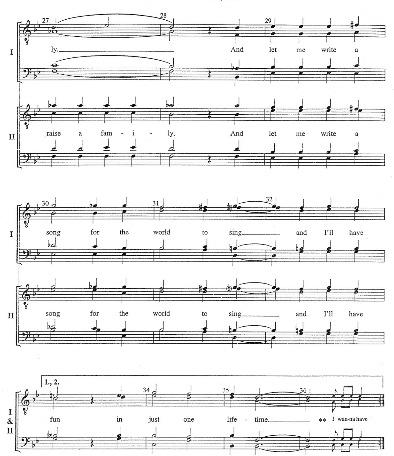
**Group I sings this pickup as Group II completes the 2nd Repeat, leading to Both Groups singing together.